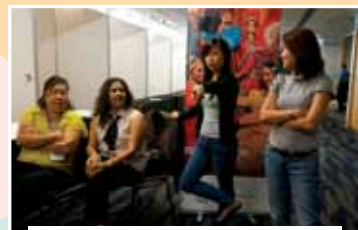
Strategic planning to wow the crowds