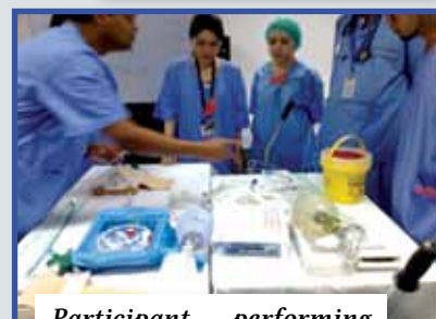
Participant performing cricothyroidotomy and jet ventilation on mannequin