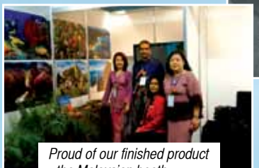
Proud of our finished product - the Malaysian booth