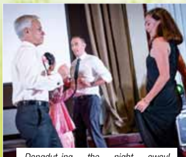
Dangdut-ing the night away! Anaesthesiologists sure have talents!