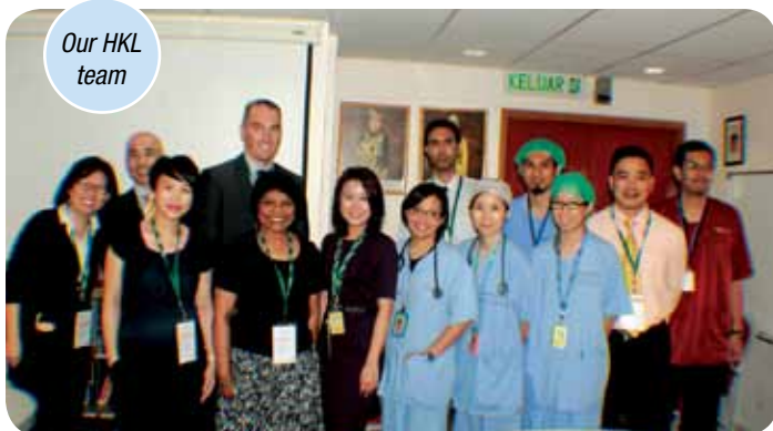
Our HKL team

It was all in all, a successful workshop and the ultimate goals of this workshop were attained.