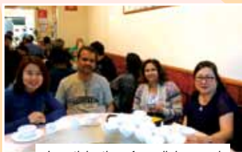
In anticipation of a well deserved meal after a hard day's work