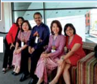
Dressed to impress at the opening ceremony