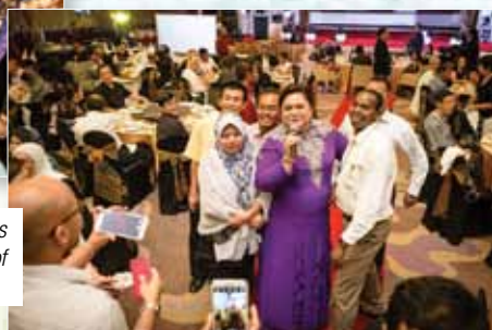
Be charmed by Adibah Noor - Fans swarming in for a close-up and of course, a selfie!