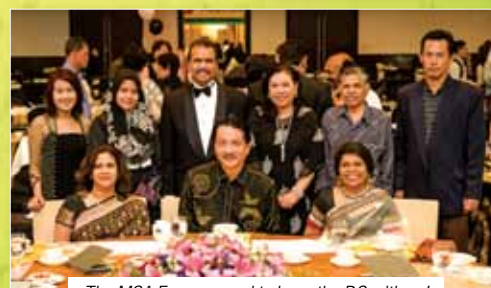
The MSA Excocs, proud to have the DG with us!