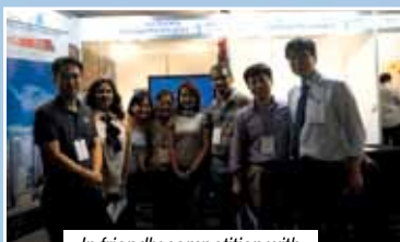
In friendly competition with our Korean counterparts

The venue for the conference was very wisely chosen being the Skycity Auckland Convention Centre, which is a state of the art convention centre located just off Queen Street, the city's central retail street and the hub of the central business district.