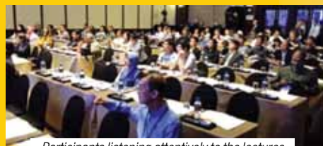
Participants listening attentively to the lectures