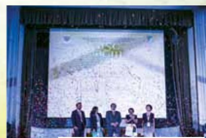
Confetti signifying the Opening of the MSA/College ASC/AGM 2014