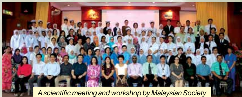
A scientific meeting and workshop by Malaysian Society of Anaesthesiologists and Sabah Anaesthesiology Department, 27 th August 2013

That there should one man die ignorant who had capacity for knowledge, this I call a tragedy.’ — Thomas Carlyle