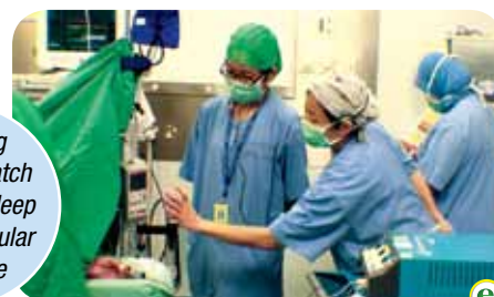
Checking the TOF watch to ensure deep neuromuscular blockade