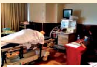
The simulator room setup