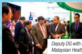
Deputy DG with the Platinum sponsor, Malaysian Healthcare Sdn Bhd