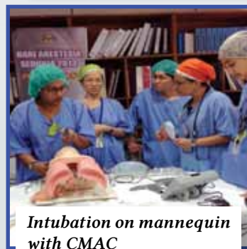
Intubation on mannequin with CMAC