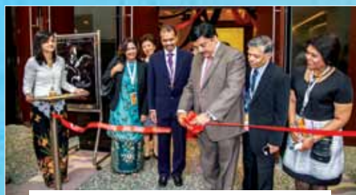
The officiation of the trade exhibition by the Deputy DG