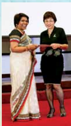
Beyond Lady Luck - The brains of research