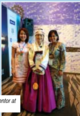
Alongside a Korean presenter at the bid presentation

Needless to say, I did not see any hobbits or any other characters from the Lord of the Rings.