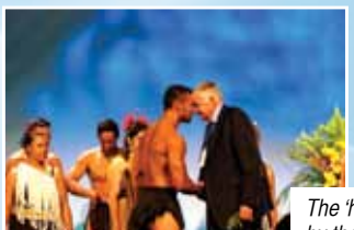
The 'hongi'-ceremonial welcome by the touching of noses