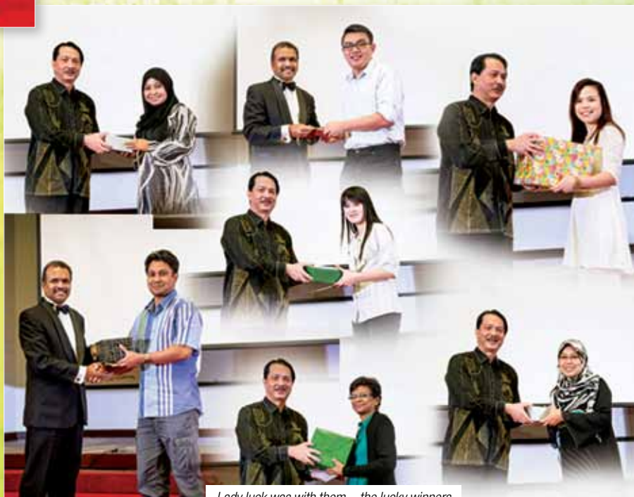
Lady luck was with them - the lucky winners