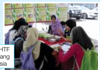
Ahli Jawatankuasa Pendermaan Organ HTF sedang memberi penerangan kepada orang awam, antara aktiviti bersama Hari Anestesia