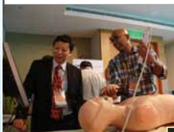
One of the participant in transoesophageal echocardiography workshop had hands-on with TEE simulator.