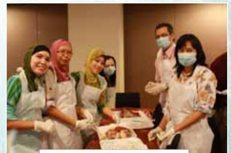
Participants in haemodynamic workshop with cow hearts.