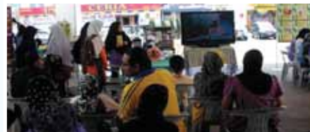
Orang ramai sedang menonton video show teknik pembiusan dan pembedahan