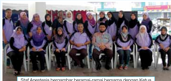
Staf Anestesia bergambar beramai-ramai bersama dengan Ketua Jabatan Anestesiologi & Rawatan Rapi Hospital Tuanku Fauziah