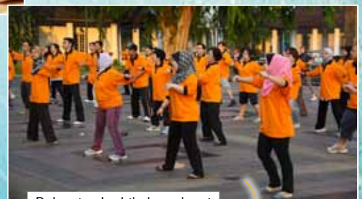
Delegates had their work-out session in morning aerobics.