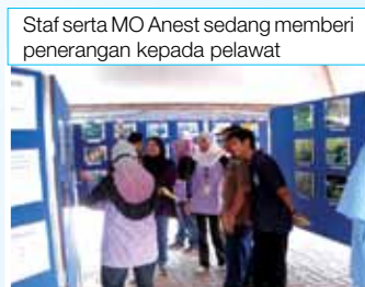
Staf serta MO Anest sedang memberi penerangan kepada pelawat