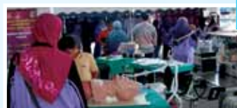
Proses intubasi keatas pesakit yang menjalani pembedahan ditunjukkan