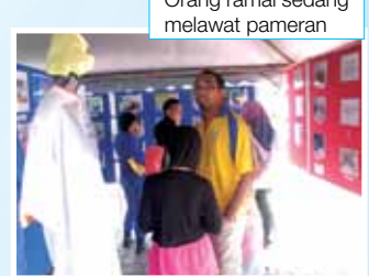
Orang ramai sedang melawat pameran