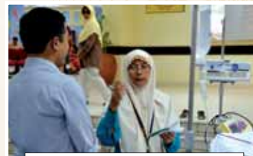
A makcik taking notes intently as the doctor explains what goes on in the OT.

By the end of the day, about 150 people visited the exhibition. Hopefully, we did send out the message that anaesthetists are doctors who manage a patient holistically throughout the perioperative period and are not just glorified gas technicians! ©