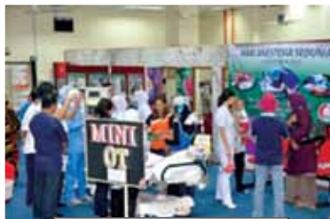
Visitors at the exhibition

The day started bright and early at 7.30 am. We started with cutting a 'birthday' cake in the Department. To the surprise of the senior anaesthesiologists, majority of the medical officers and some of the specialists in the Department did not know why 16 th October was chosen to be the Anaesthesia Day. Wah! A lot more education needs to be done.