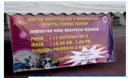
Pemasangan banner di Hari Anestesia