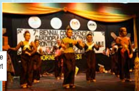
A very energetic and vibrant performance from Sarawak General Hospital Heart Centre's dancers.