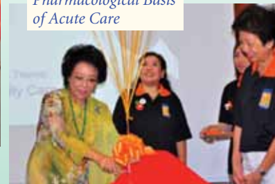
Launching of the book Pharmacological Basis of Acute Care