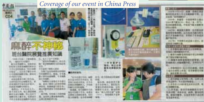
Coverage of our event in China Press

Finally we would like to thank the Organising Committee of the Pantai Hospital Ipoh National Anaesthesia Day Exhibition including the Management and the Corporate Communication team as well as the Malaysian Society of Anaesthesiologists for their support towards the event.