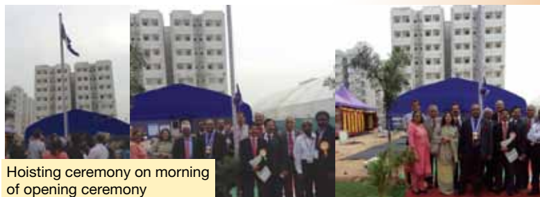
Hoisting ceremony on morning of opening ceremony

The Indian Society of Anaesthesiologists was formed the same year India gained independence in 1947. Their Society has more than 20,000 members with an active membership of 8,500. India is a large country with a population of 1.3 billion people. It was interesting to note that each state has its own anaesthesiology council that is represented in the main council.