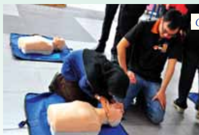
CPR session in progress