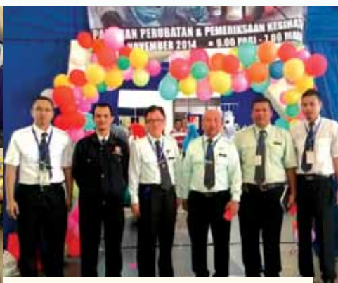
Participation of officers from the Kedah State Health Department