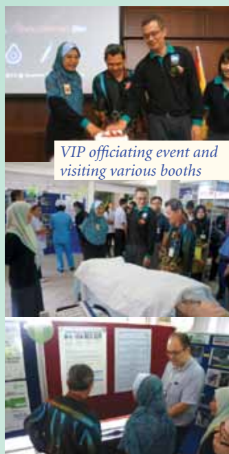
VIP officiating event and visiting various booths