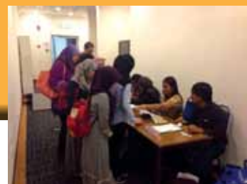
Participants at the registration counter

General feedback from the audience was that it was very enlightening and they hoped that we will be able to hold the symposium on a yearly basis.