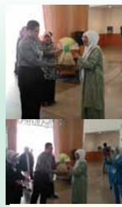
Acknowledgement to the Director by Head of Department