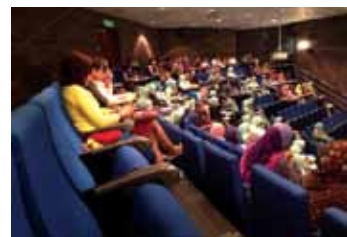
Participants at the symposium