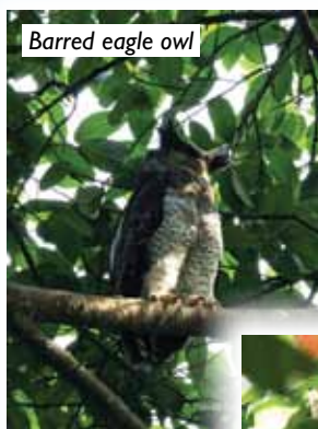
Barred eagle owl

In my conversation with her, she did share with me an experience that I think would really surprise all of us who only knew her as the "Boss" but not the outdoor adventure person. She narrated a trip she did to West Papua, Indonesia soon after her retirement in 2011. "I joined a group of international birders comprising 1 British, 1 Aussie, 2 Thais and 2 Malaysians led by an experienced bird guide who is a Belgium national. The main target for the trip was of course the famed 'Birds of Paradise' (BOP) which are only found in this part of the world. To look for BOP, we had to hike for 12 hrs deep into the primary jungle and camp there for three days. We slept on wooden planks on stilts, used dug out hole as latrine and bathed in streams. It was very rough terrain and physically trying but the sights and sounds of the jungle were magical and the trip had a surreal feeling. In the end, we were rewarded with all the five species of BOP we targeted (there are about 20 species scattered all over Papua New Guinea) including the very rare Wilson's. I remember on one occasion, the six of us in the team had to sit very still without a word uttered in a cramped bird hide made of palm leaves for 5 hours for the BOP to arrive. But when the bird did appear and perform the spectacular courting dance, even for a brief moment, it was worth all the 'suffering'."