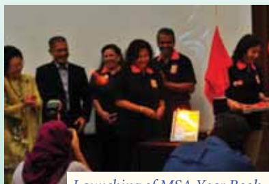
Launching of MSA Year Book

After the book launch, the guests proceeded to the exhibition area where a few booths had been set up. One booth showcased the achievements and contributions of the Department of Anaesthesiology in University of Malaya in the field of anaesthesia over the years namely in the area of research and teaching of the future generation of anaesthetists. Posters in this booth included research articles produced by the department and published in notable journals over the years. There was also another booth which highlighted the innovations in anaesthesia such as the video laryngoscope to facilitate difficult intubation and infusion pumps for target controlled infusions.