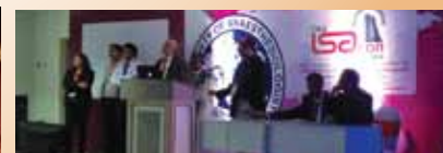
Taking questions after my presentation