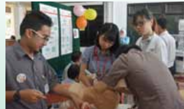
UCSI students learning the proper method of endotracheal intubation.

The aim of this year's celebration was to increase the public awareness regarding the safety of anaesthesia and the numerous anaesthetic services provided in HSNZ. Various booths were set up, display of posters promoting the services in anaesthesia, history of this vital field of medicine, OT and ICU simulations and not to forget the mini museum; where assorted anaesthetic machines and equipment and airway adjuncts