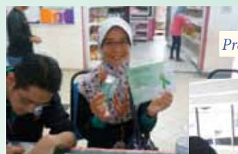
Proud new organ donors

General Hospital including cardiothoracic anaesthesia in Pusat Jantung Hospital Umum Sarawak, information on general and regional anaesthesia, importance of fasting and informed consent, fitness for anaesthesia and labour epidural. The posters were an instant hit with the public as there were gifts offered for answering the associated quiz questions, with the gifts being snapped up within hours. Even the organ donation booth successfully recruited 95 new organ donor pledges.