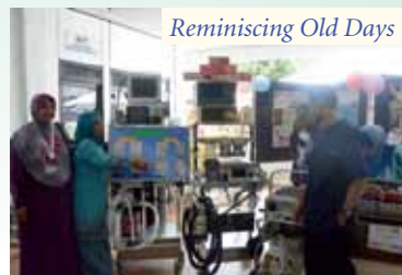
Reminiscing Old Days

used in anaesthesia over the decades were displayed. The event was indeed a success as we received an overwhelming response from the public and also health care providers.