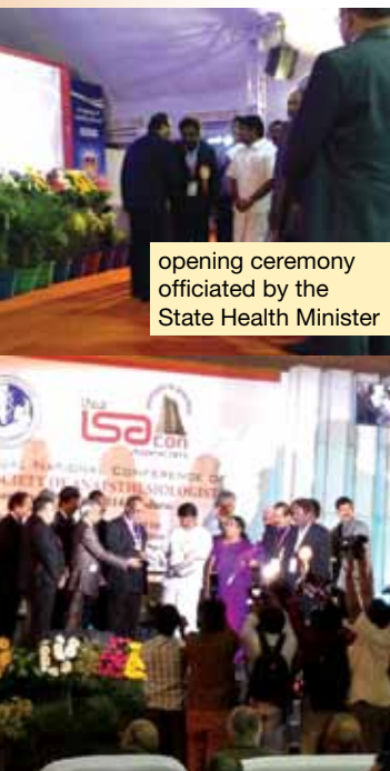
opening ceremony officiated by the State Health Minister

The theme of the Gala/Fellowship Night was from the show "Survivors". It was very lovely with good food and entertainment. The Executive Committee was introduced on stage. They had the usual award ceremony. The next item of the social event included an incredible dance performance. Again the dancers were all medical staff and anaesthesiologists. What talent!