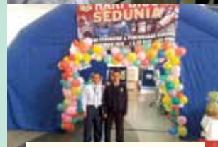
Officiation of Carnival