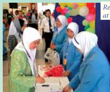
Registration of visitors at the Carnival