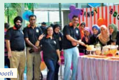
Guests at the candy booth