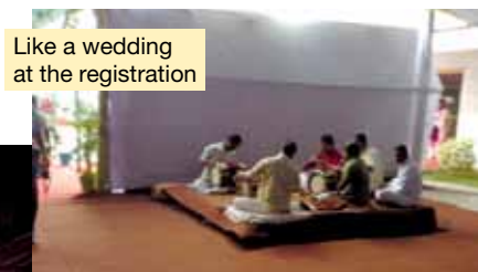
Like a wedding at the registration

Overall it was a wonderful experience attending the various Asian meetings as it serves as an eye opener generating more ideas when you return to develop your society. The inroads have been built, and as I leave my position as President, I am confident that the future Presidents will continue this effort to build more inroads with the Asian countries.