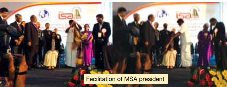
Felicitatation of MSA president

similar to our year book. The evening also saw the Past Presidents felicitated by the Minister of Health. I too was felicitated with a shawl and countered the gesture with a memento from our Society. It was indeed appreciated by the President!