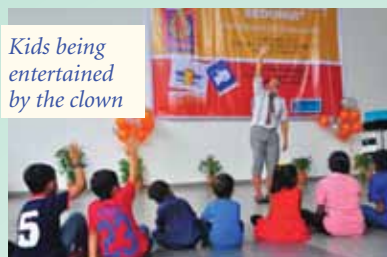
Kids being entertained by the clown

The celebrations ended with lunch and a prize giving session for the winners of the games. All the guests enjoyed themselves and learnt some basic life support skills. It was truly a fruitful and enjoyable way to spend a Sunday morning.