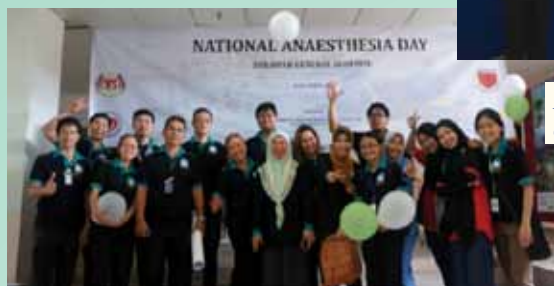
Members of organising committee