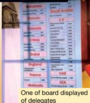
One of board displayed of delegates

No conference is complete without a good social programme! The second evening saw the 'Kollywood' night with modern dance performances and modelling show. Two excellent performers kept the crowd rocking. The evening concluded with two international deejays spinning an excellent choice of music. The third evening, the Gala Night, was traditional. There was an amazing performance of a large musical orchestra and dance performances by