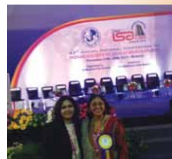
With a council member who is a pain consultant from Ahmedabad