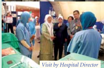
Visit by Hospital Director and other dignitaries