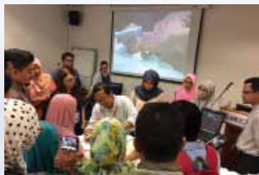
Hands-on session on volunteers