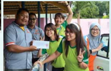
Contestants happy to have located the clues.