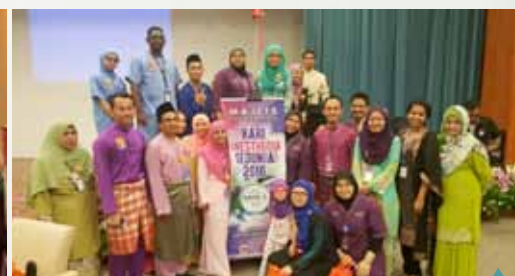
Launching of event: World Anaesthesia Day 2016, HSAS

hospital. In addition to that, video presentation about journey to anaesthesia and explanation about GA machine also caught the attention of members of the public.