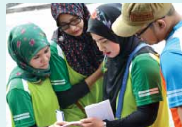
Contestants hard at work trying to decipher the puzzles.