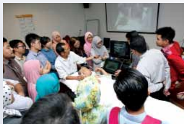
Hands-on session on subclavian vein scanning using ultrasound