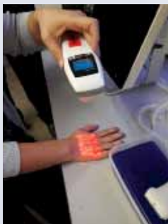
Adjuncts for vascular cannulation

Recently, an Advanced Vascular Access Workshop had been designed specifically to assist doctors and anaesthetists towards competency, underpinned by theoretical knowledge in the practical skills required to insert intravenous central and peripheral lines and arterial cannula.