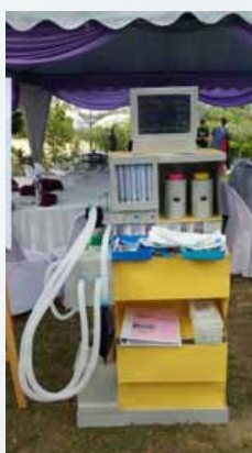
▲ GA machine