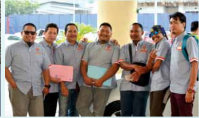
The team of medical assistants guarding the clues inside the colourful folders.