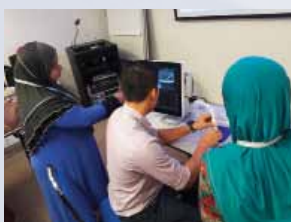
Practical session on blue phantom