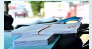
Envelope containing clues to their next destinations.