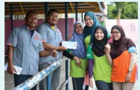
Contestants from operation theatre joining in the fun.