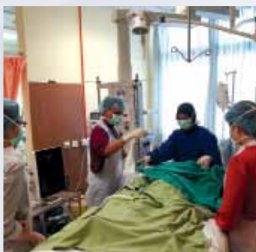
Practical session for CVL cannulation on ICU patient