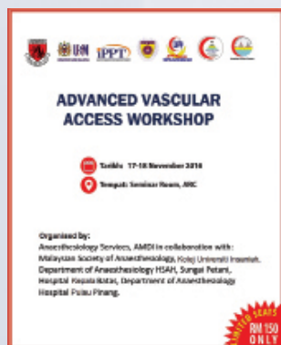
Collaboration between different institutions for a better patient care