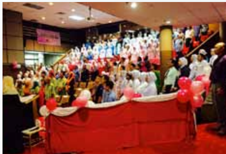
▼ Auditorium function