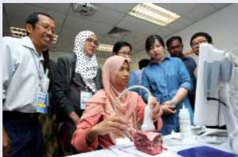
Practical session on meat-based phantom