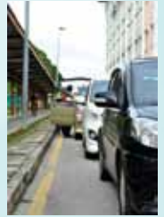
Contestants inside their cars awaiting for flag off.