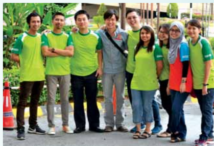
Some of the contestants, committee members and photographer of the day.