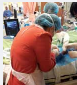
Practical session on ultrasound guided arterial line cannulation