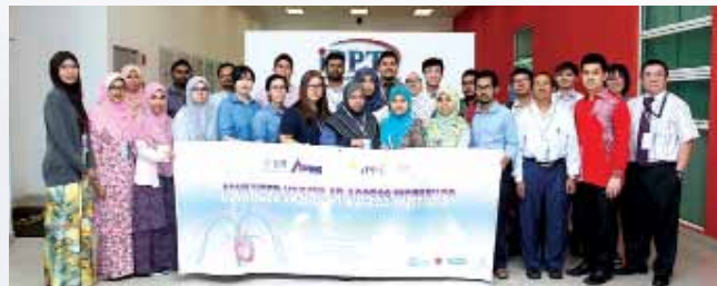
The first Advanced Vascular Access Workshop