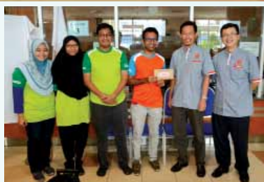
First place goes to team from obstetric and gynaecology and public health department.