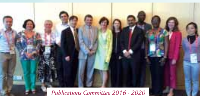
Publications Committee 2016 - 2020