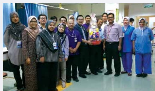
After the Hands-on session in ICU of Kepala Batas Hospital