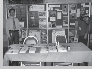
Continued on page 10