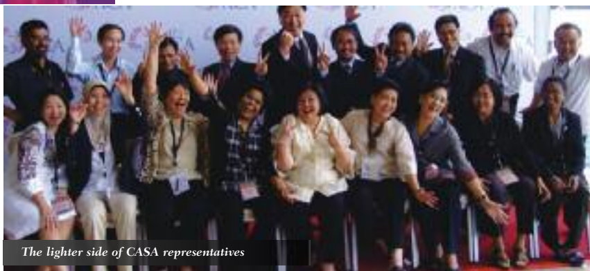
The lighter side of CASA representatives