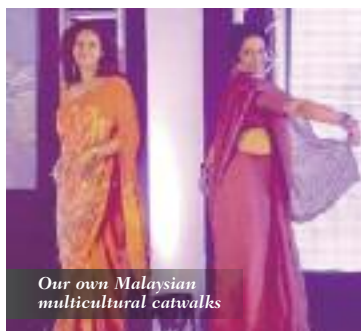
Our own Malaysian multicultural catwalks