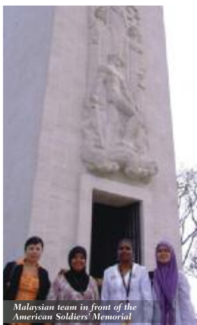
Malaysian team in front of the American Soldiers' Memorial

In all, the 17 th ASEAN Congress of Anaesthesiologists in Manila was indeed an unforgettable experience for all of us. We will be looking forward to the 18 th ACA in Singapore in year 2013.