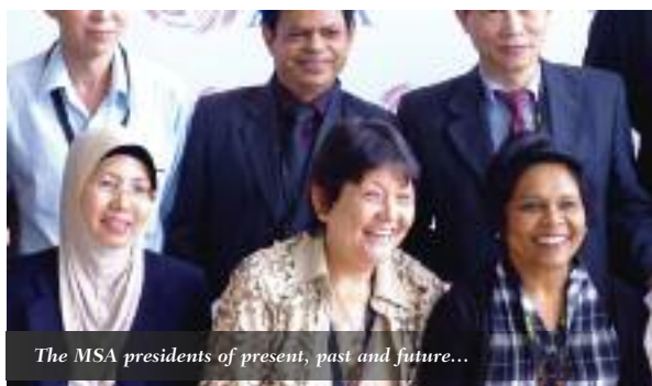
The MSA presidents of present, past and future...