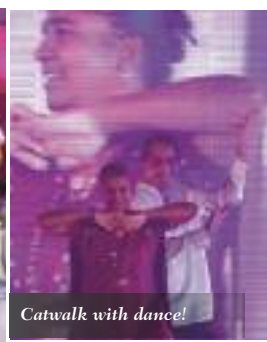
Catwalk with dance!