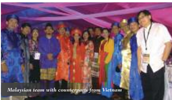
Malaysian team with counterparts from Vietnam